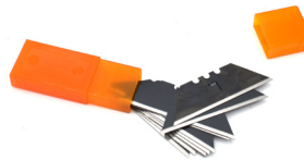
Replacement Blades #10912 (PK/5)